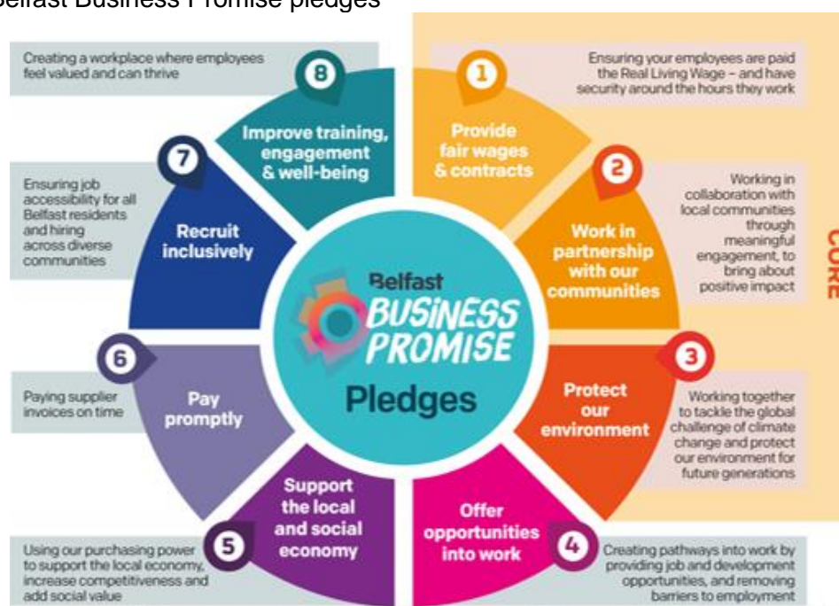
Figure 1: Belfast Business Promise pledges

3.5 An underpinning accreditation process has been developed in conjunction with key Council Departments, partner organisations such as the Labour Relations Agency and external advisers, including those with expertise and experience in auditing quality standards (IIP, EFQM and ISO standards). This has been tested and enhanced during the pilot phase to ensure that it aligns to other good practice standards, provides assurance around the robustness of the process and recognises the challenges organisations are facing in the current economic climate.